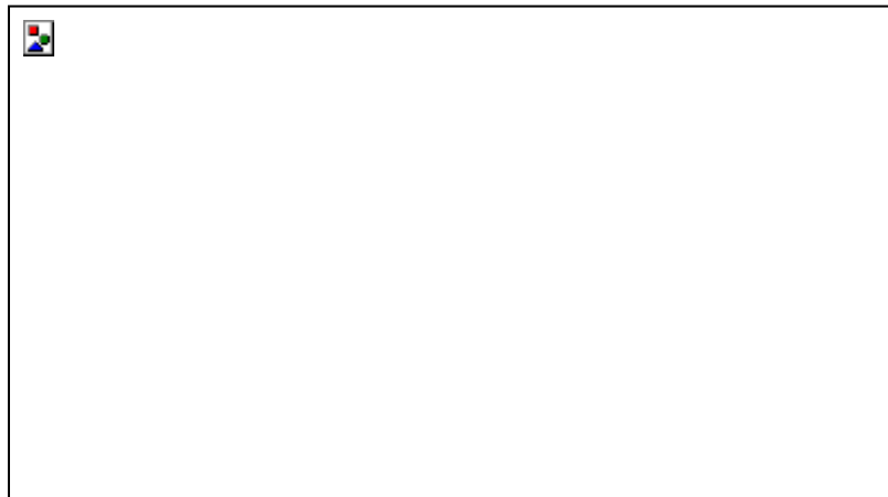
Figure 1. This is the caption for the above Figure in font 10pt. The caption must be centered.

Figures are to be inserted into the text nearest its first reference and must be referred to within the body of the text preferably before the figure appears. The text in the figures should be reasonably readable, no smaller than 9pt, and preferably in Times New Roman. Figure captions go below the figure in 10pt Times New Roman. Please ensure that the figure is contained within the margins of the manuscript. The use of colors is permitted. See Figure 1 for an example.