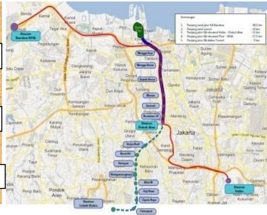
Figure 3. Route concept of the project.

The SHIARL route will span 38.5 kilometers and connect Halim Airport in eastern Jakarta with Soekarno–Hatta Airport by using the median of the intercity toll road. The route would be divided into three sections: The first would be Halim Airport to Dukuh Atas, with elevated lanes for 12 kilometers. The second would be Dukuh Atas to toll road Sedyatmo, near Pluit, built as the PRASTI Tunnel stretching 9 kilometers, with an estimated depth of around 25–40 meters underground. The third would be toll road Sedyatmo, near Pluit, to Soekarno–Hatta Airport, with elevated lanes for 17.5 kilometers. The route selection also considers flood-area mapping in Jakarta, and links the West Flood Canal to Pluit Reservoir. Details of the route can be seen in Figure 3.