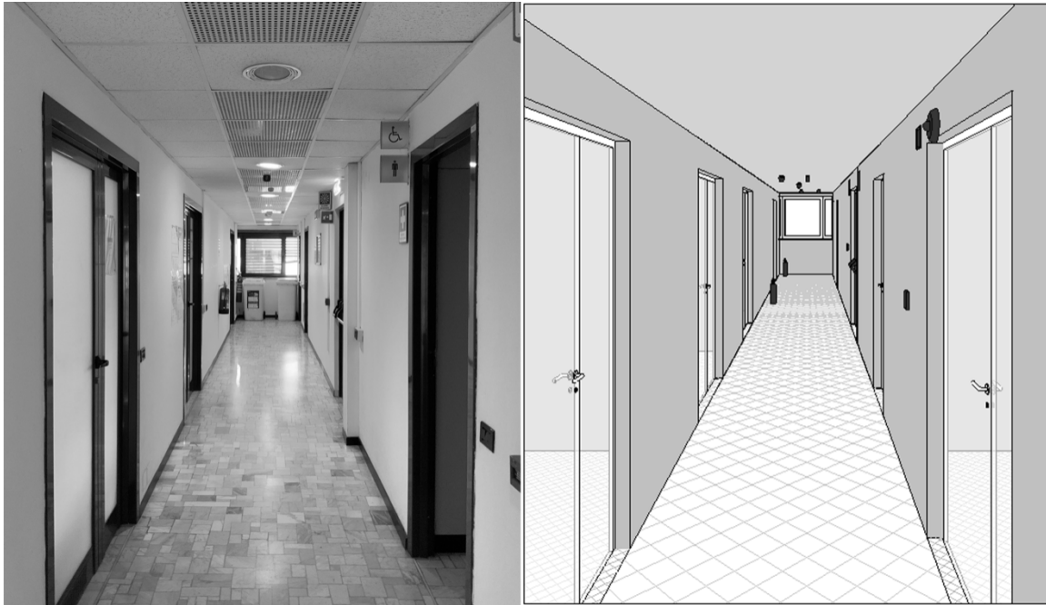
Figure 2. Camera sensors installed in the building corridor.

As previously stated, the first part of this research regards the use of cameras as sensors, as shown in Figure 2. Further developments regard the possibility of building monitoring through IAQ (Indoor Air Quality), humidity, and CO 2 sensors, to provide a complete evaluation of the building indoor environmental quality.